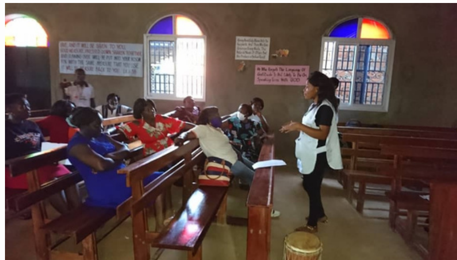
Sensitization in church,