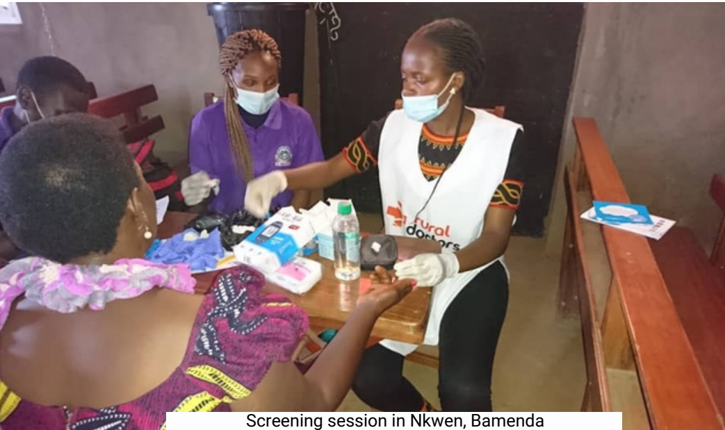
Screening session in Nkwen, Bamenda

Through Rural Doctors' work in the North West and South West regions of Cameroon, over 2500 people were sensitized about NCDs and over 250 adults screened in five communities (Batoke, Tole, Mile 16, Buea Town and Nkwen).