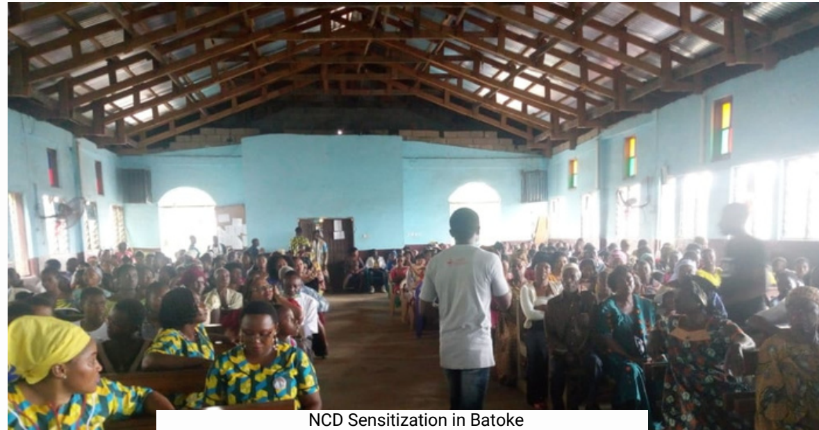
NCD Sensitization in Batoke