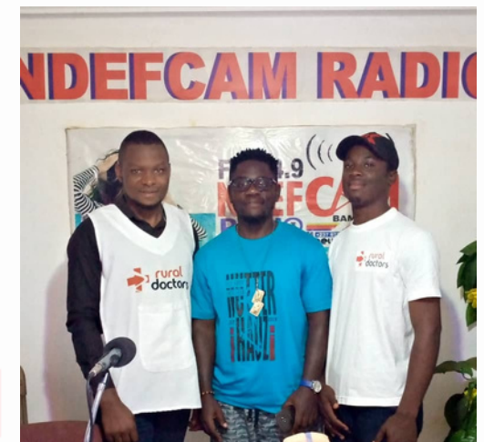
Volunteers after NCD sensitization session in NDEFCAM radion station, Bamenda