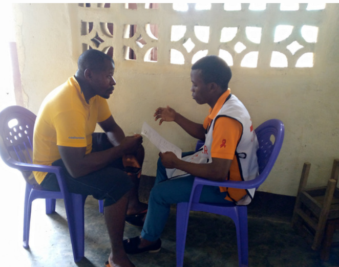
Volunteer in counselling session , Batoke